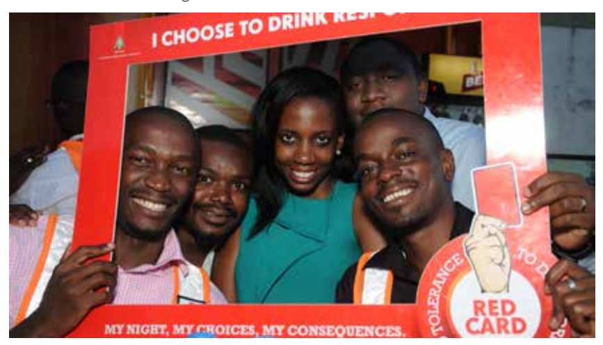
Some of the UBL staff participating in the Red Campaign.

In fulfilment of the CEO Commitments, the Red card campaign against Drunk Driving engaged over 5,000 consumers creating awareness and drive behavioural change in the consumption of alcohol. In addition, the business commissioned a research study to understand the incidences/triggers of underage consumption and its impact around Uganda ahead of the conversation on regulation.